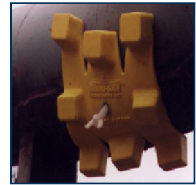
MP-811- for use on larger diameter piping and radii surfaces, or tough holes in corner or odd shaped steel parts or equipment