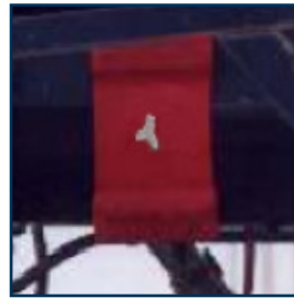
MP-711- For use on larger steel surfaces such as bins and hoppers, chute bottoms and troughs or similar