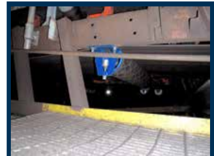
SureGuide® in action preventing belt damage