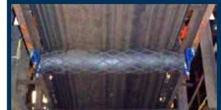
Adjustable tensioning brackets assure proper tension for maximum belt tracking performance